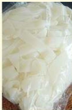
Fresh flat rice noodles