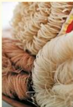
Dried rice vermicelli noodles