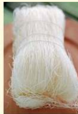
Dried bean thread noodles (Cellophane noodles, Glass noodles)

Noodles, Dried Flat Rice Probably the most popular noodle in Thailand, these noodles come in many sizes, as thin as ⅛ inch (3 mm) and as wide as ¾ inch (2 cm). Transform these noodles into soups and stir-fried dishes. Soak for 30 minutes in room temperature water before a quick boil. More often than not dried