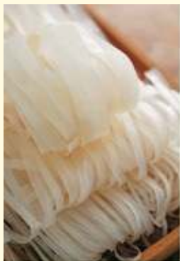
Dried flat rice noodles

Mint (Peppermint) Mint’s unique ability to produce a refreshing cooling sensation gives it a star role in the Southeast Asia. It may pack a wallop of flavor yet extensive exposure to heat kills its flavor so it’s usually eaten raw or added at the very last moment. There are two primary varieties: peppermint (more commonly used), which has wrinkled leaves and hard woody stems; while spearmint has smooth darker green leaves and soft edible stems and has a more assertive bite—same as Thai basil.