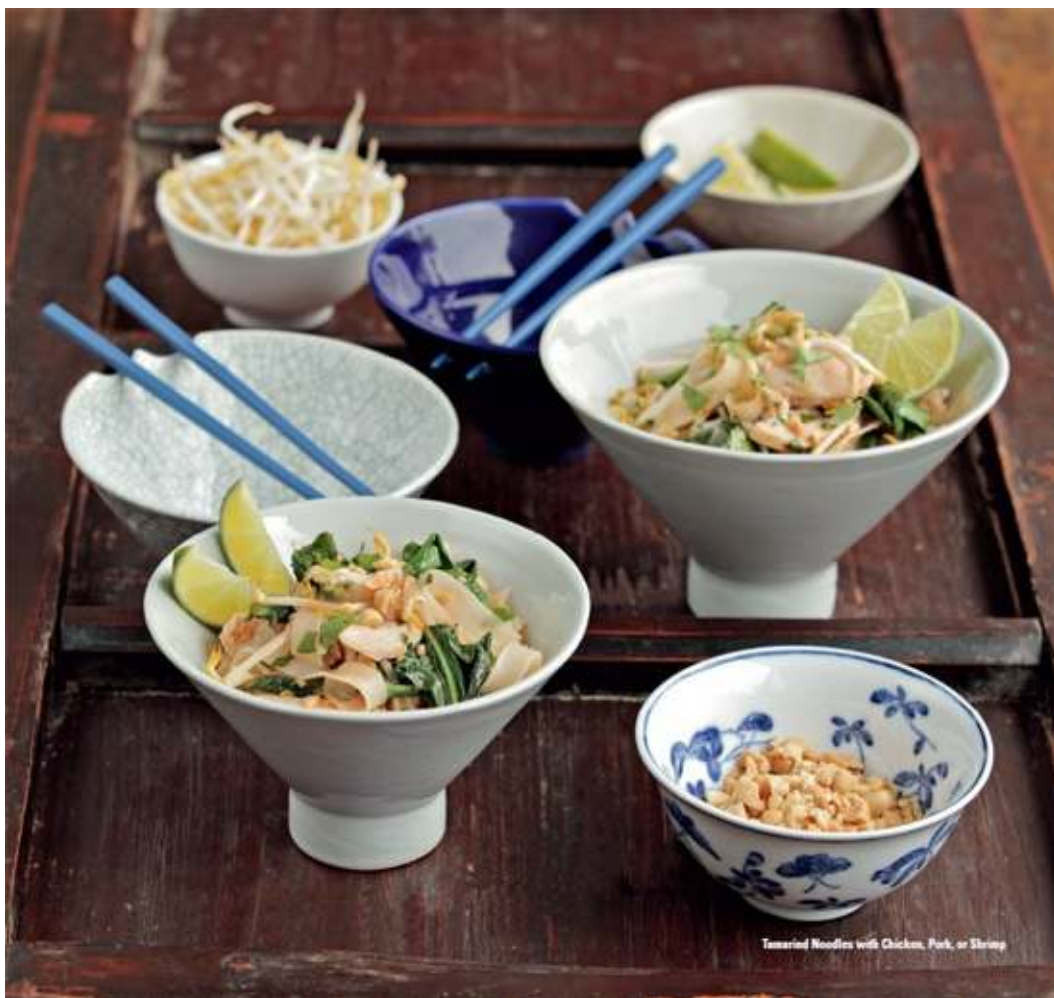
Tamarind Noodles with Chicken, Pork, or Shrimp