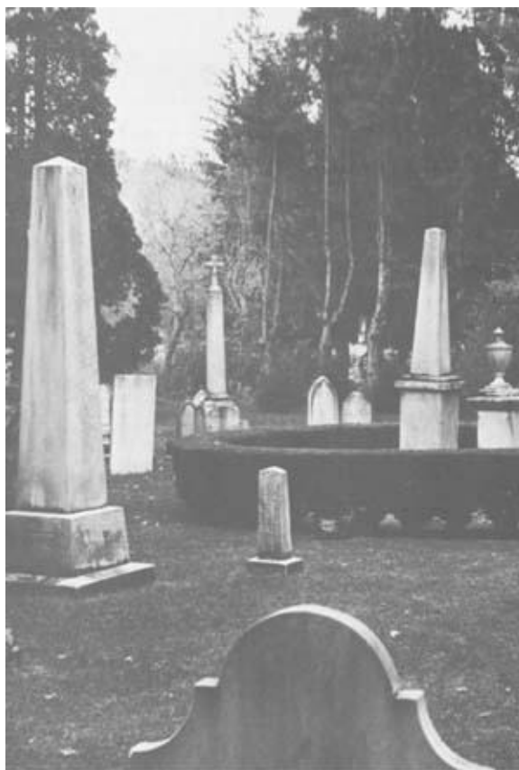
The Sedgwick Pie, Stockbridge, Massachusetts