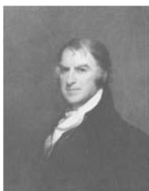
Judge Theodore Sedgwick (1746-1813) by Gilbert Stuart