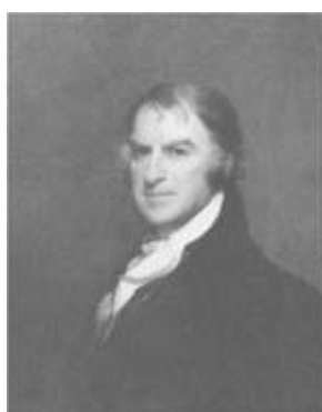
Judge Theodore Sedgwick (1746-1813) by Gilbert Stuart