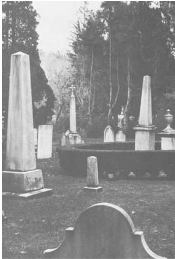
The Sedgwick Pie, Stockbridge, Massachusetts