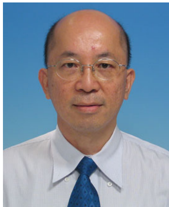
David S. K. Wong Additive Manufacturing Innovation Centre, Nanyang Polytechnic, Singapore