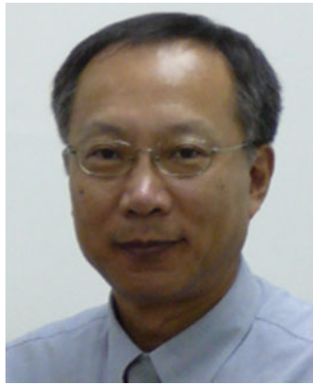
Bin Song Sustainable Manufacturing Centre, Singapore Institute of Manufacturing Technology, Singapore