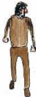
WALK AROUND BUS CHECKING FOR DAMAGES.