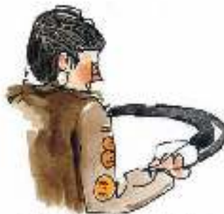
CLEANING TIRE AND WHEEL