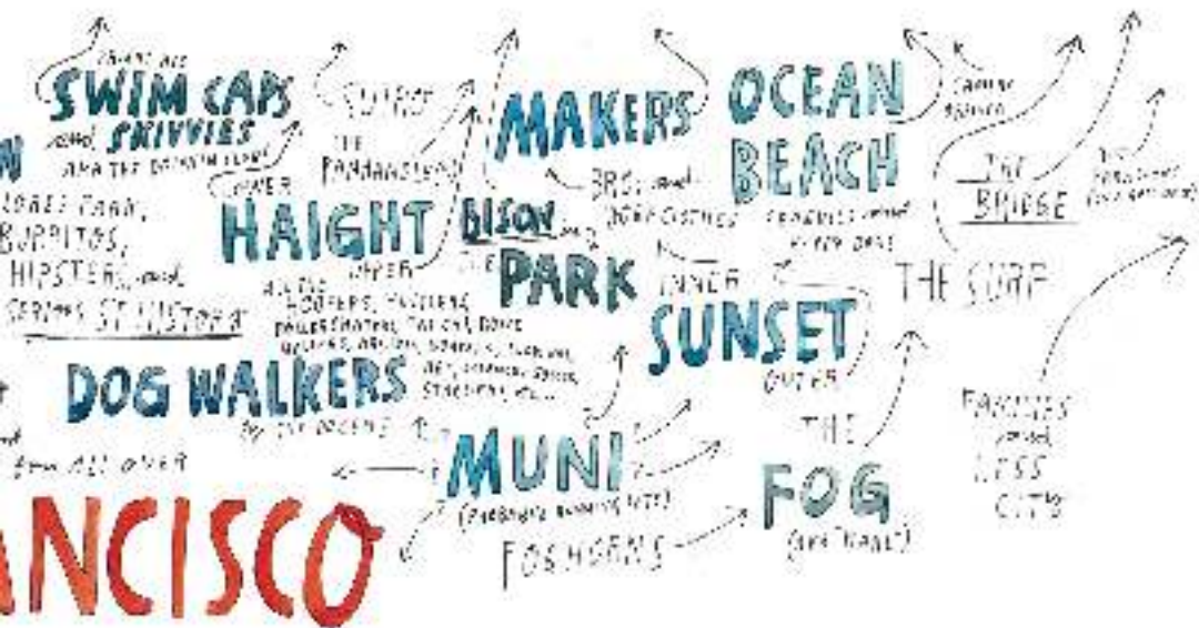
San Francisco word cloud, created by @mattmiller, 2013.