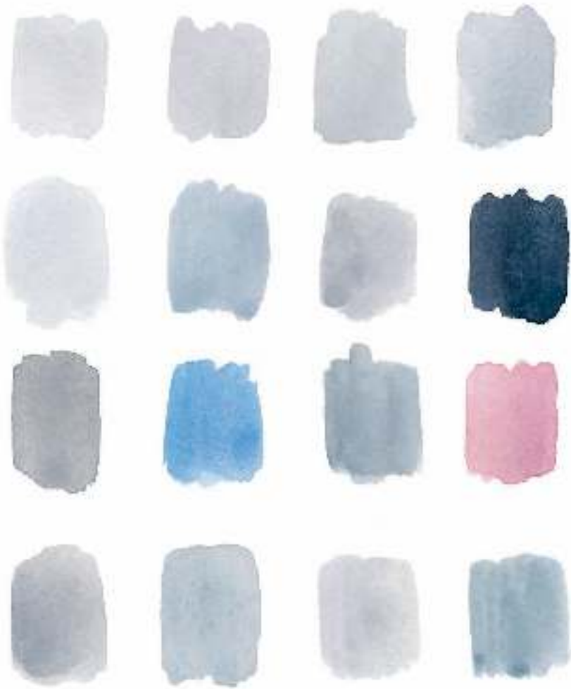
SAMPLE of SF SKIES