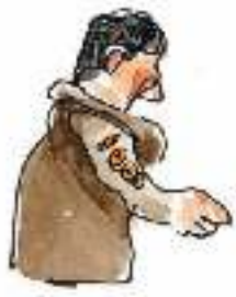
CHECKING PAPER TRAY