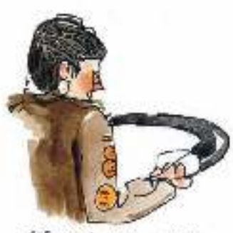
CLEANING STEERING WHEEL