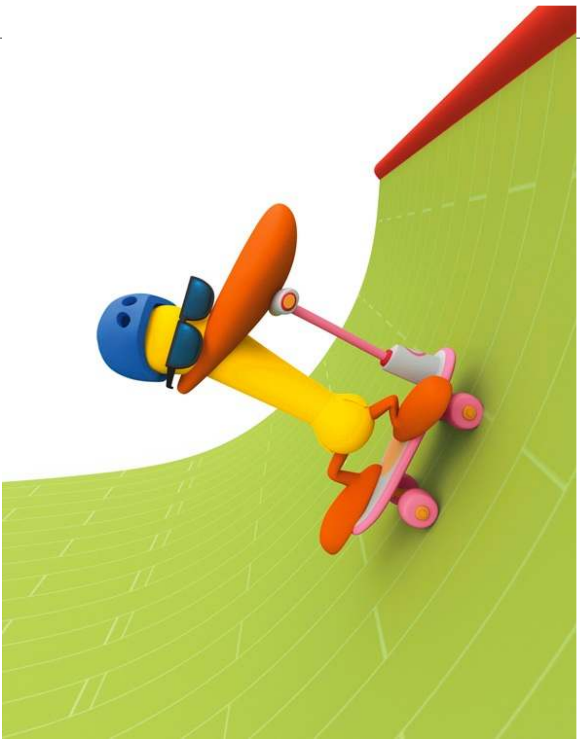
Pato rolls up.