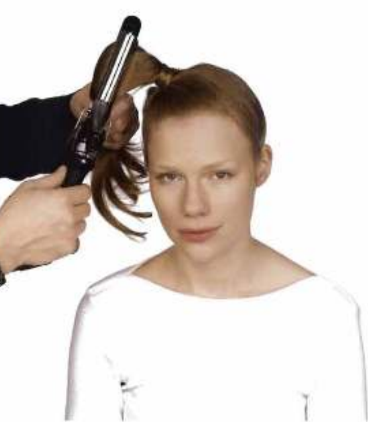
5. Smooth hair using a curling iron, 24mm diameter. Work from roots down to ends.