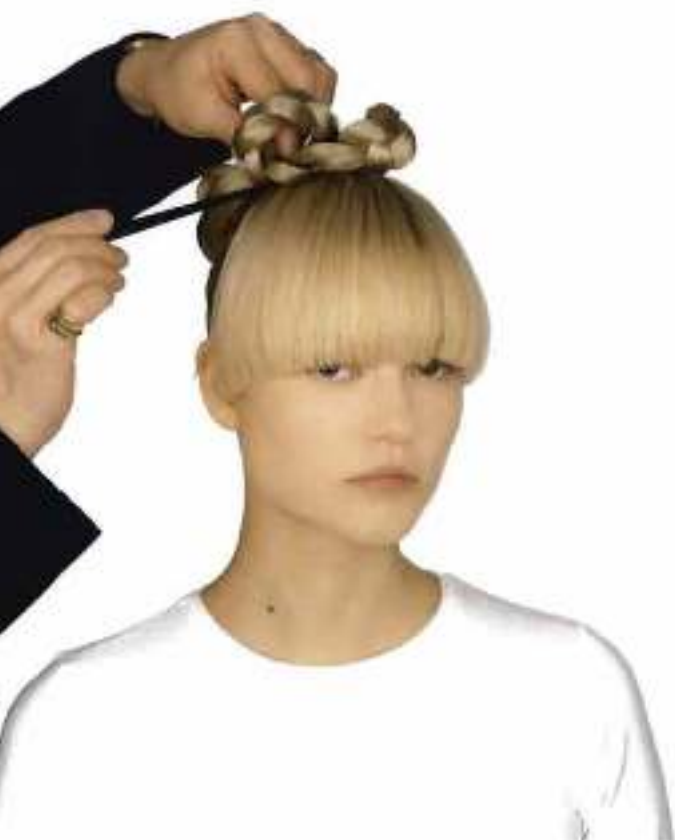
11. Coil plait round and secure in place with pins.