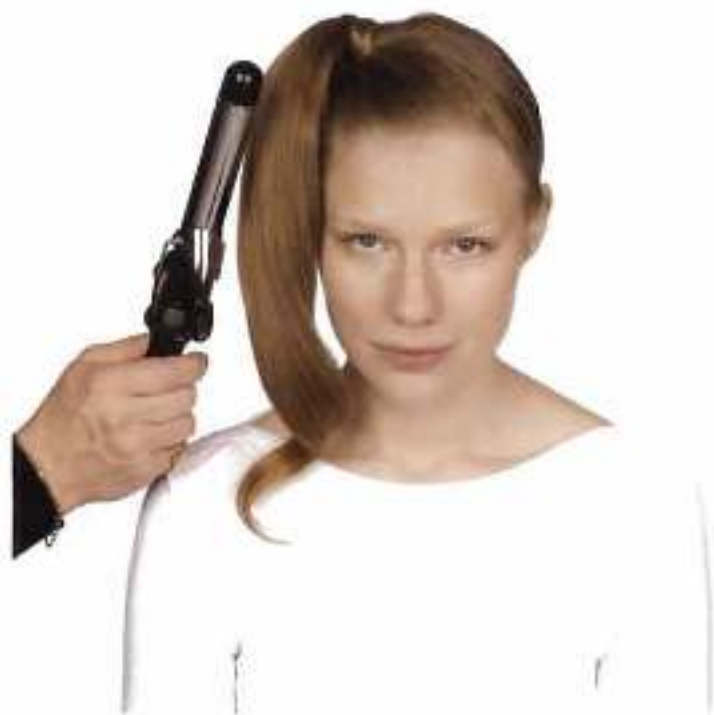
6. Sleekness rather than curl is achieved with this type of tong. This forms basis for the style.