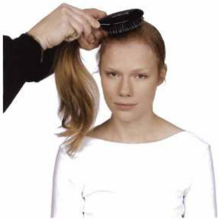
2. Use a grooming brush to smooth hair into a ponytail at one side.