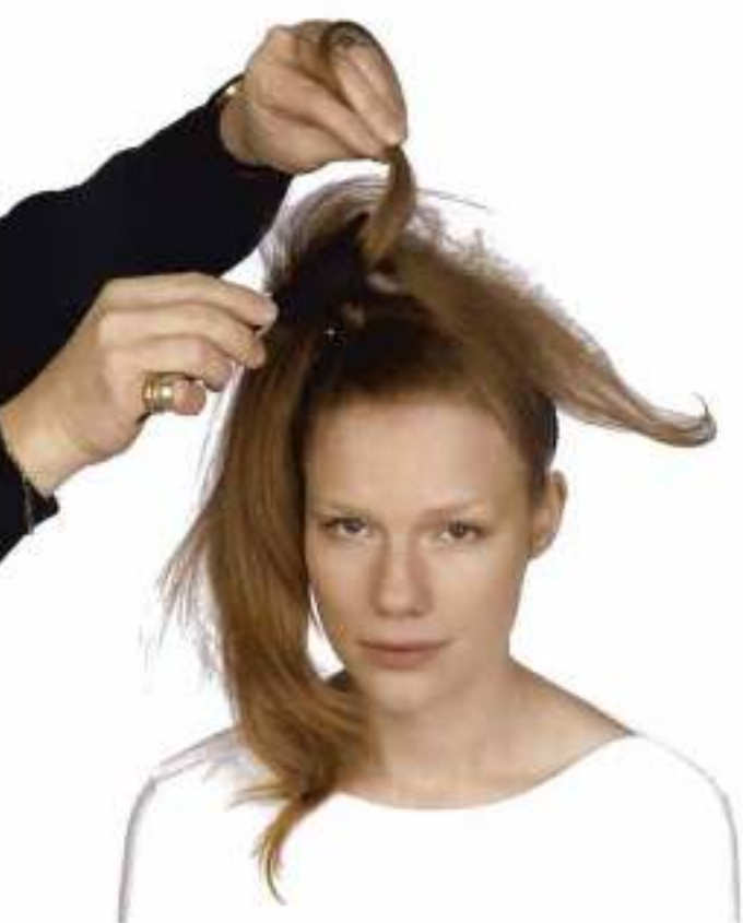
7. Take a fine section of hair from ponytail and backcomb starting 5cm from ends, work to roots.