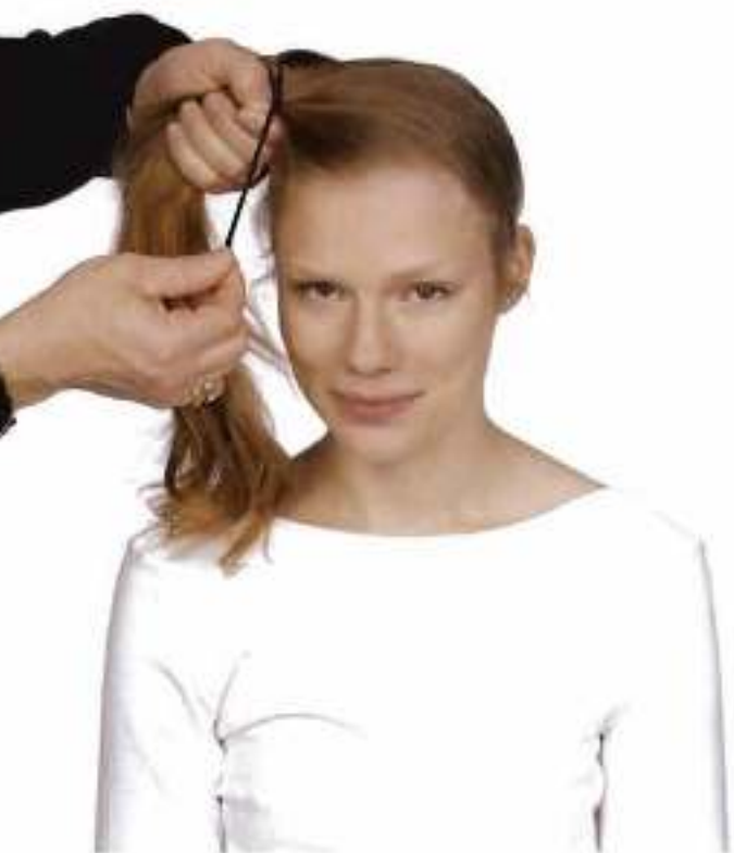
3. Secure ponytail in covered hooked band making sure you keep the tension whilst holding the hair.