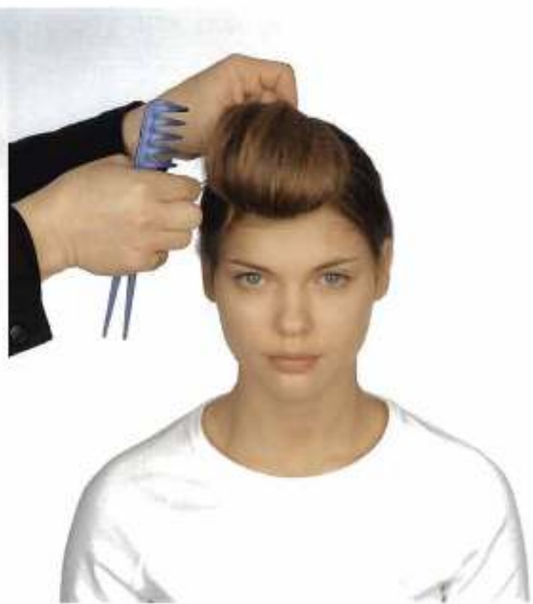
12. Tuck in ends and secure with grips.