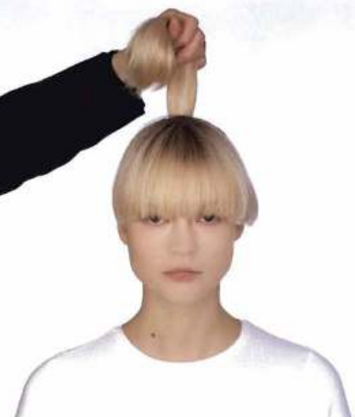
3. Scoop hair into a ponytail on crown. Secure with a covered band.