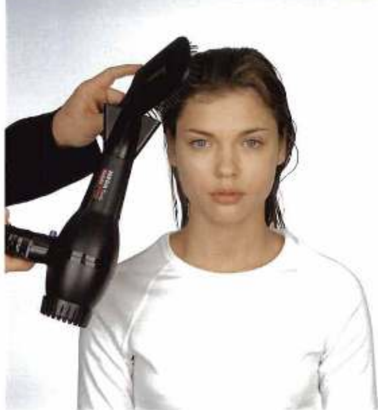
2. Use a paddle brush to dry hair, brushing continuously as you dry for a smooth finish.