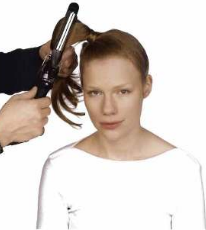
5. Smooth hair using a curling iron, 24mm diameter. Work from roots down to ends.