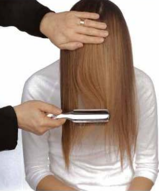
5. Brush hair forwards from crown.