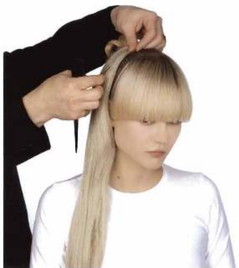
8. Grip hairpiece in place to base of ponytail.