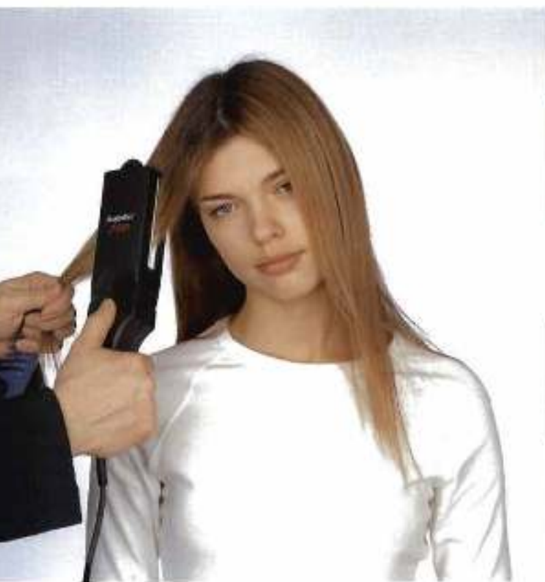
3. Straighten hair, a section at a time, using straightening irons.