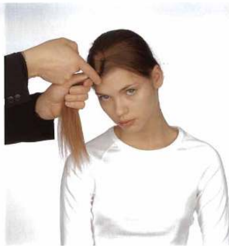
8. Secure with grip at base of the twist.