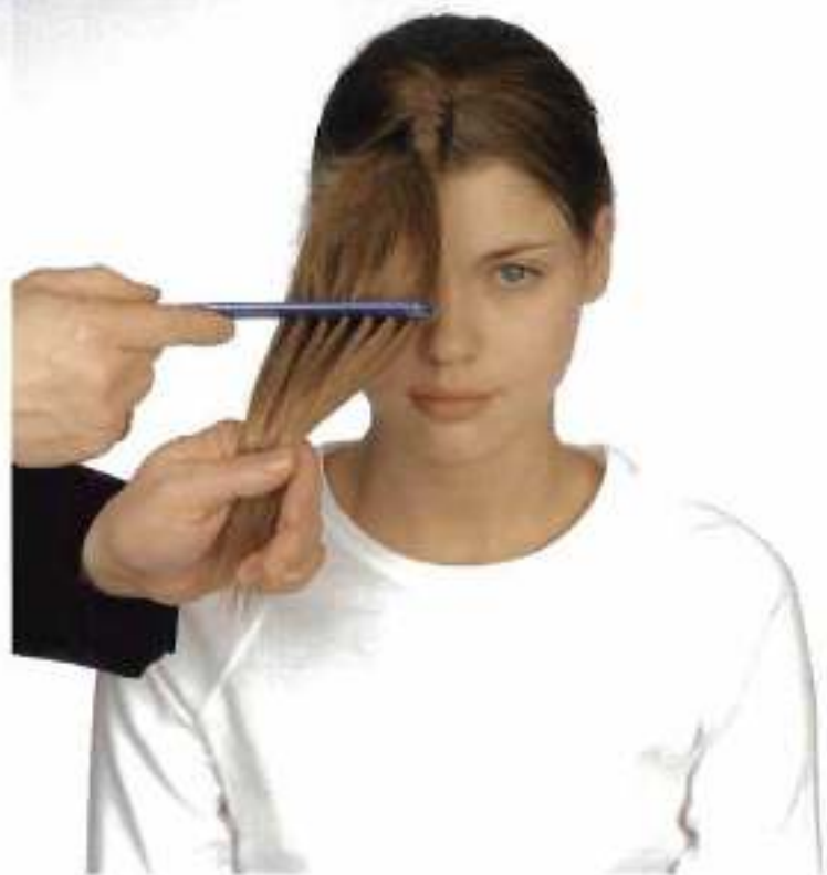
10. Backcomb ponytail from midlengths towards roots.