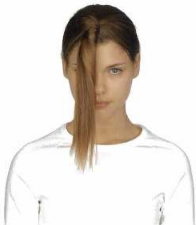
9. Secured hair.