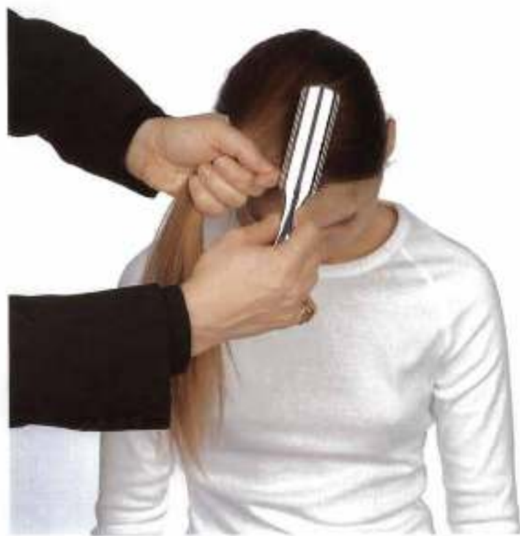
6. Smooth hair into a slightly offset ponytail at hairline.