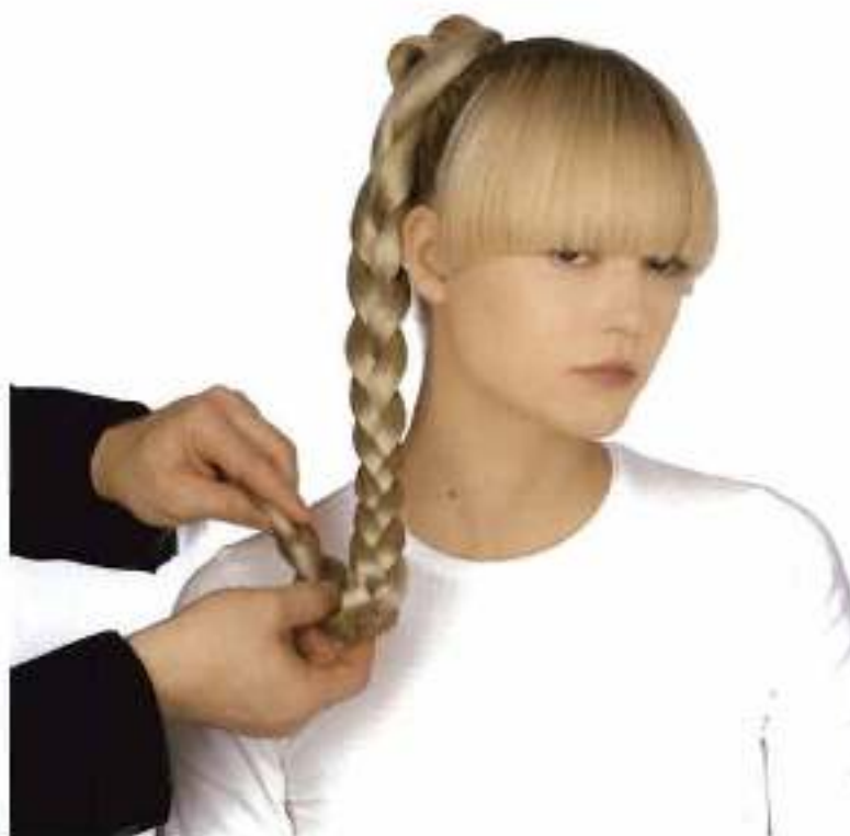
10. Continue plaiting down to ends of hairpiece.