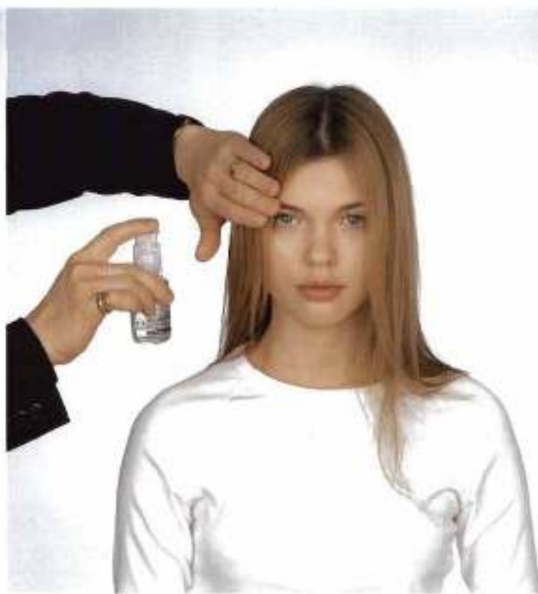
4. Smooth serum through outer layers of hair to banish any flyaway ends.