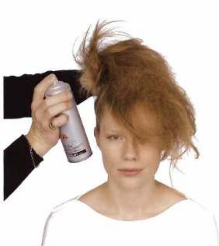
8. Backcomb remaining ponytail hair and mist with fixing spray.