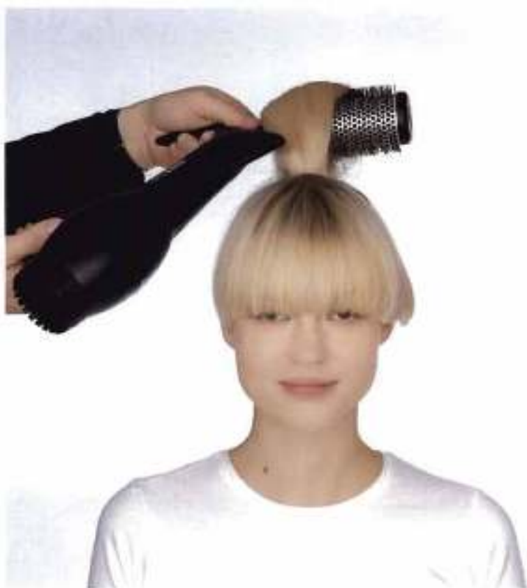
4. Smooth ponytail using a hot curl brush and heat from hairdryer.