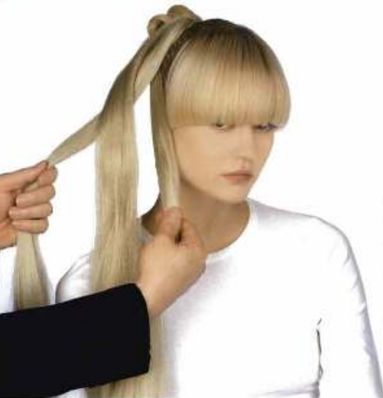
9. Divide hairpiece into three equal strands and begin to plait.