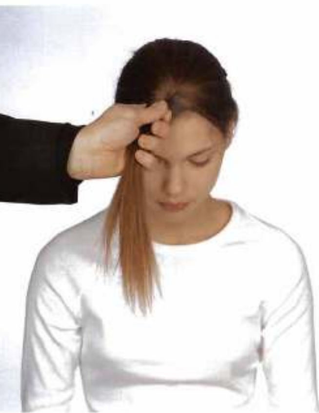
7. Clasp hair in hand, twist clockwise and secure base of the twist.