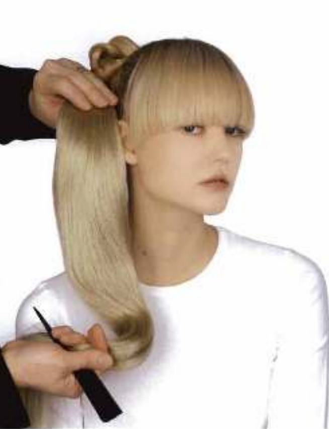
7. Match hairpiece to hair colour.