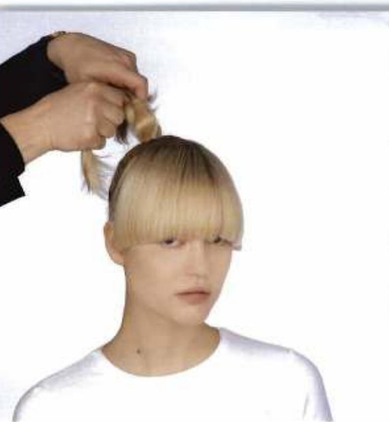
5. Divide ponytail into three equal strands and plait to ends.