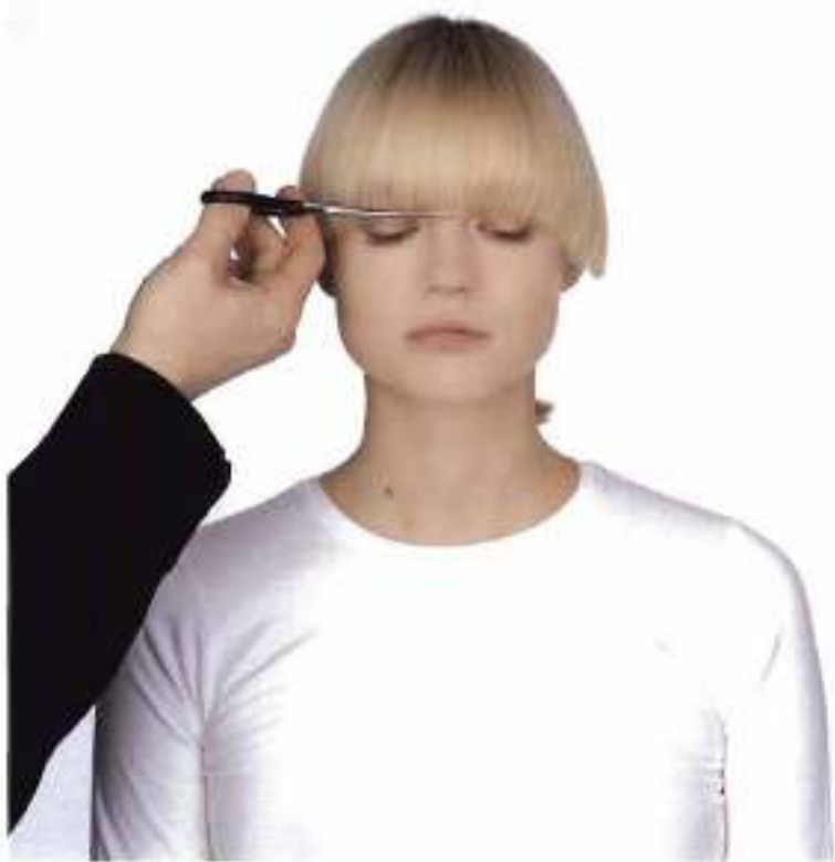
2. Trim fringe to give a neat line.