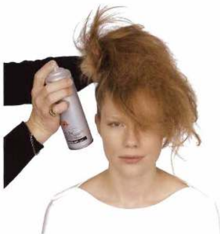
8. Backcomb remaining ponytail hair and mist with fixing spray.