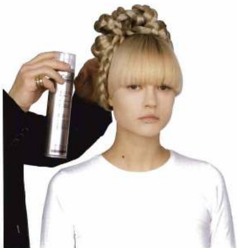
12. Repeat process using another hairpiece, but this time allow a section to loop down over one ear. Mist with hairspray.