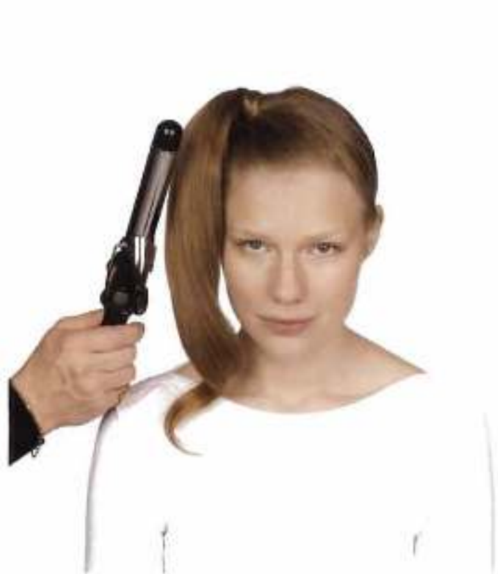
6. Sleekness rather than curl is achieved with this type of tong. This forms basis for the style.