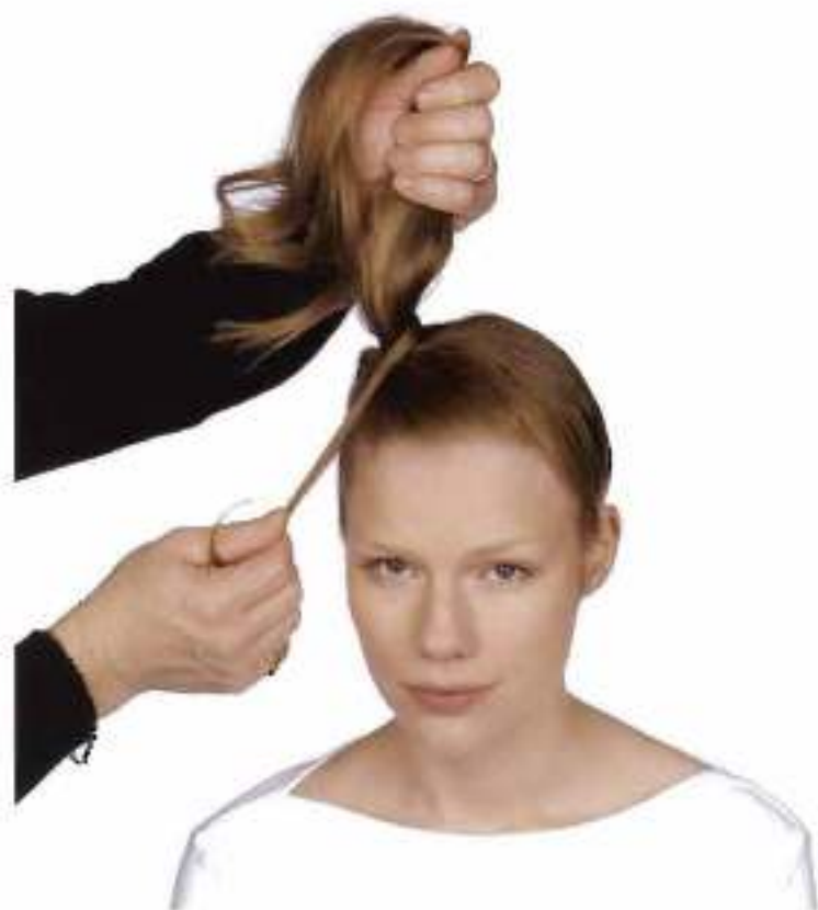
4. Take a small section of hair and use to cover the band, secure in place with grips.