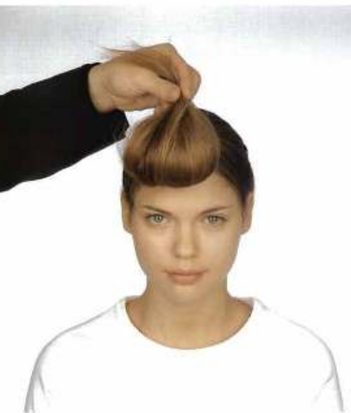
11. Fold over holding ends with hand.